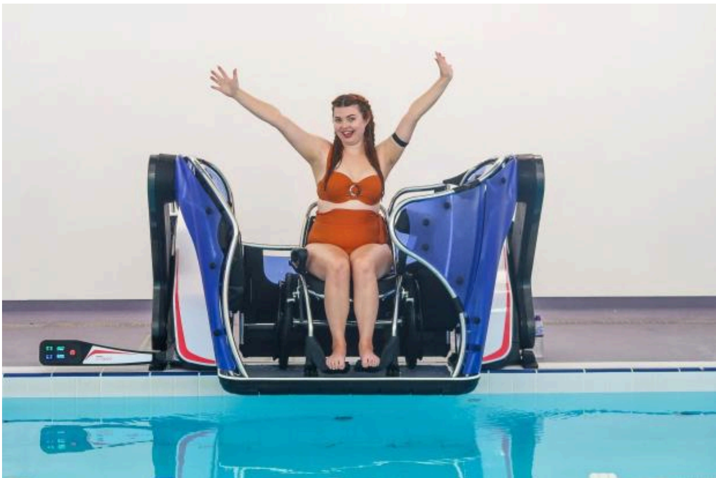
The Poolpod 3.0 allows wheelchair users to access the pool at Eversley Leisure Centre

The sites, which are managed by Everyone Active in partnership with Basildon Council, offer an array of inclusive sporting facilities, including the state-of-the-art fully wheelchair-accessible pool.